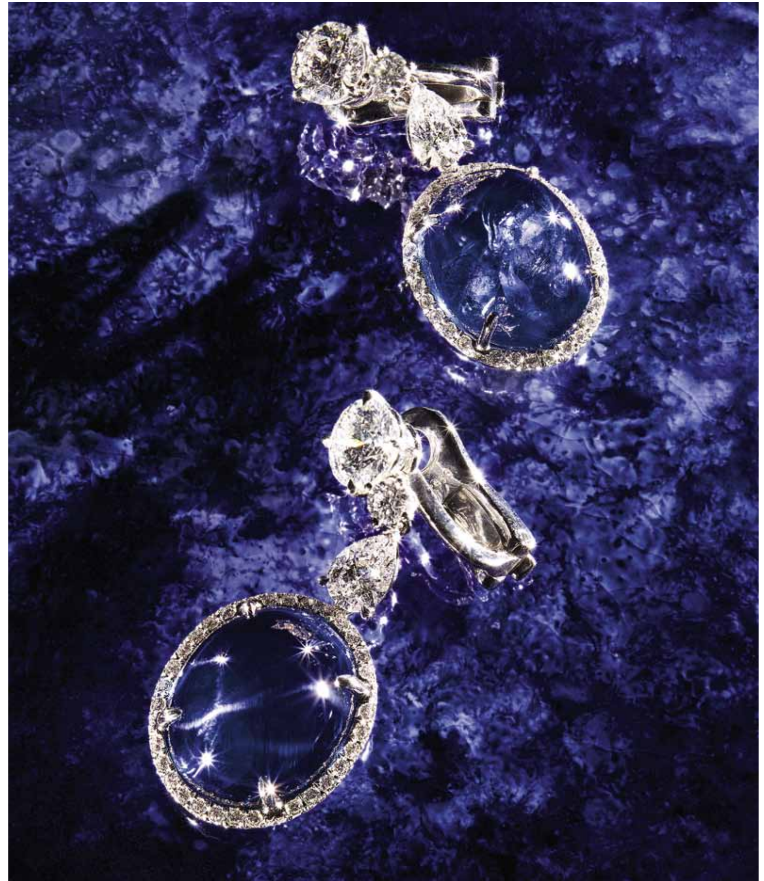
PROP STYLING BY LINDEN ELSTRAN