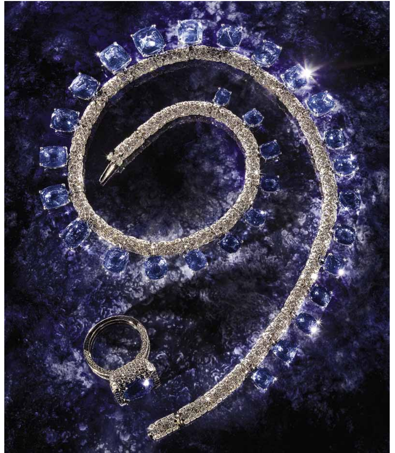
Sapphires are also said to inspire creativity and strengthen the intellect. To see why, look no further than this De Grisogono diamond necklace with 30 blue sapphires (price upon request) and Solange Azagury-Partridge blackened-gold Cup ring with sapphire and diamonds ($53,000). Opposite: A 20-carat-cushion-cut sapphire and diamond ring from Graff (top, price upon request) paired with a five-carat sapphire and diamond ring by Chopard (price upon request).