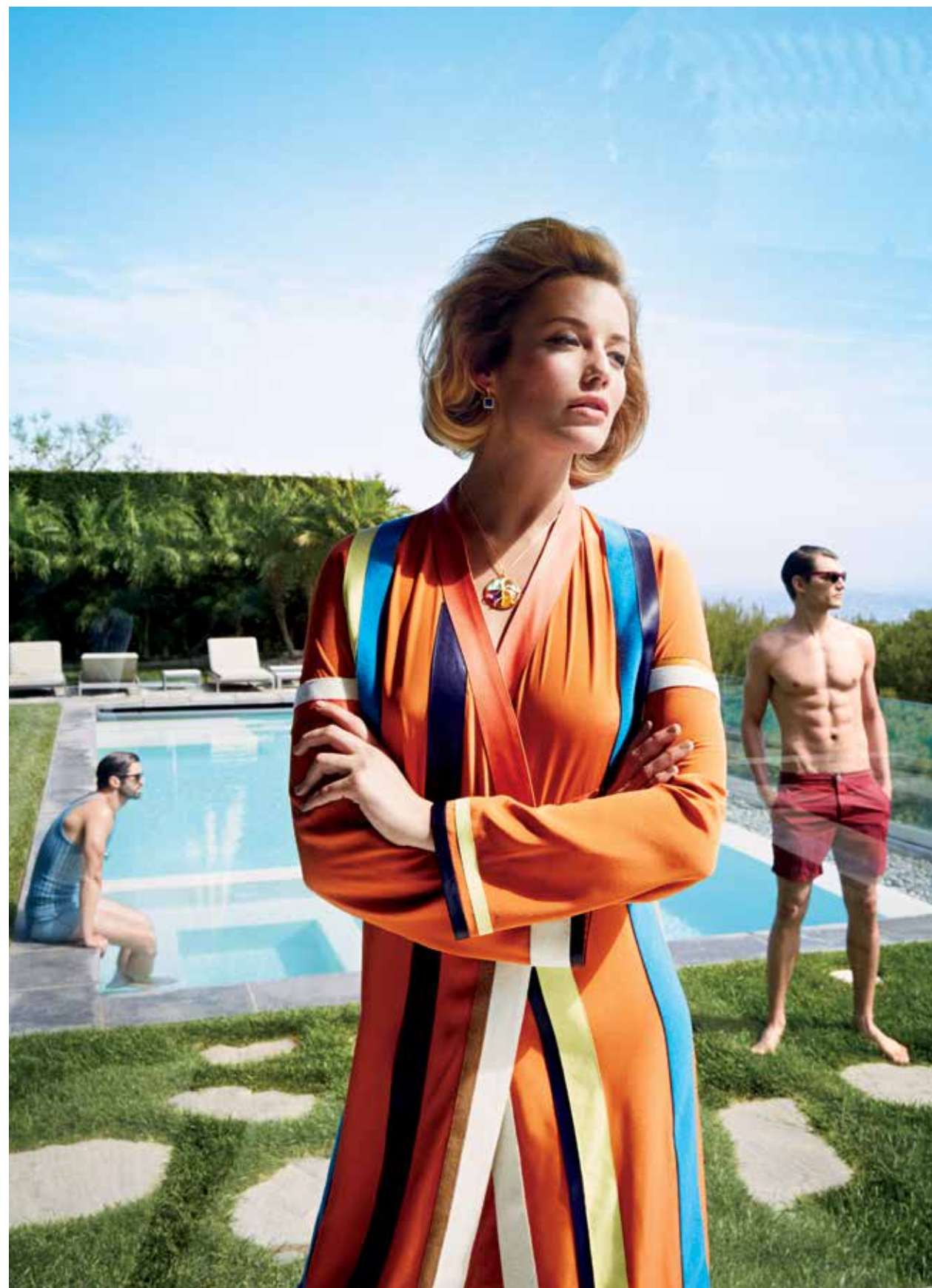
HERMÈS crêpe de chine dress ($12,400). JENNIFER MEYER lapis and diamond earrings ($4,150). KARA ROSS amethyst, citrine, topaz and diamond pendant ($8,300). On left: DOLCE & GABBANA tank top ($695) and shorts ($525). PAUL SMITH sunglasses ($315). On right: BRUNELLO CUCINELLI swim trunks ($530). OLIVER PEOPLES WEST sunglasses ($265).