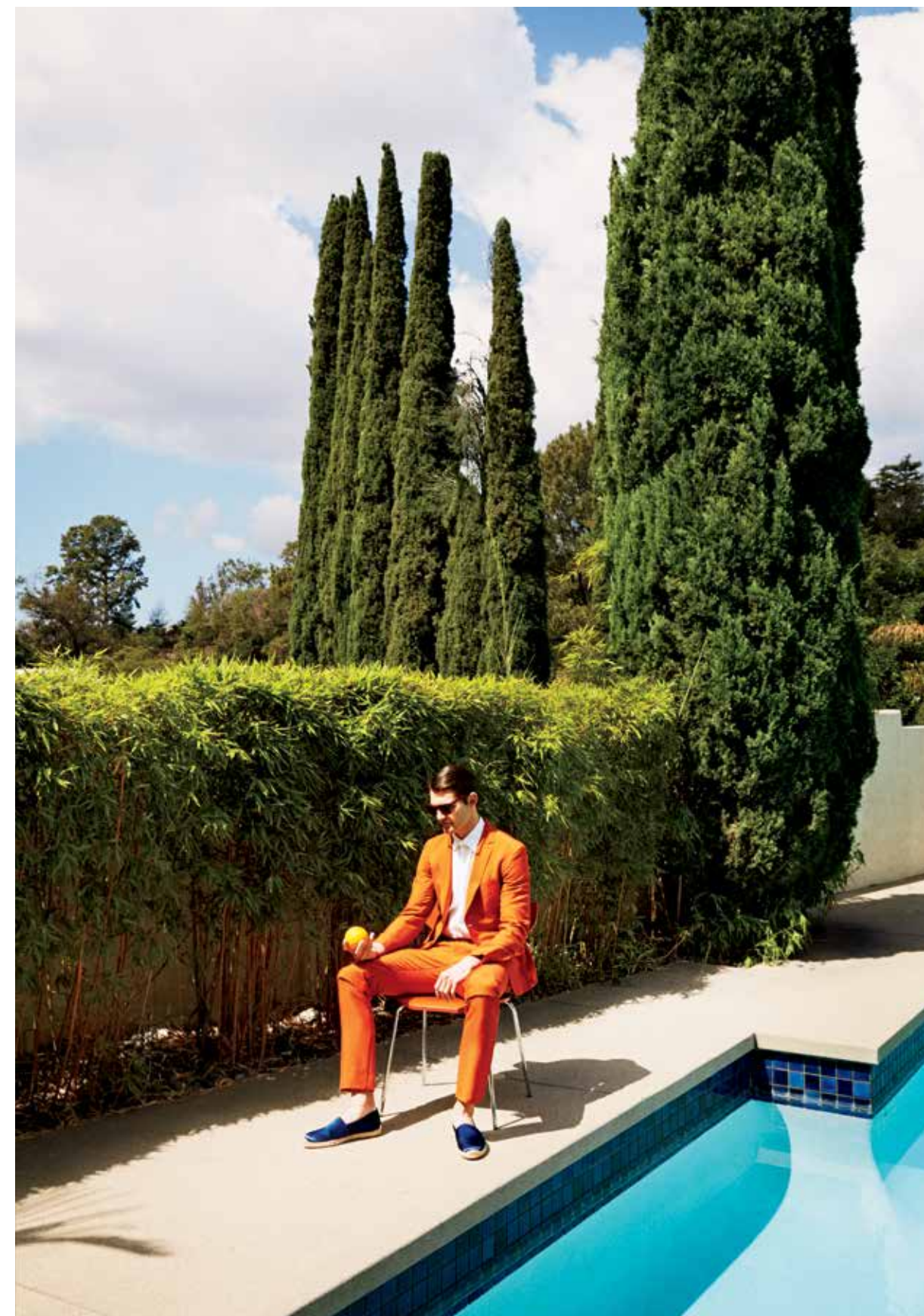
SALVATORE FERRAGAMO wool blazer ($2,150), shirt ($390) and trousers ($990). CHRISTIAN LOUBOUTIN espadrilles ($440). OLIVER PEOPLES sunglasses ($335).