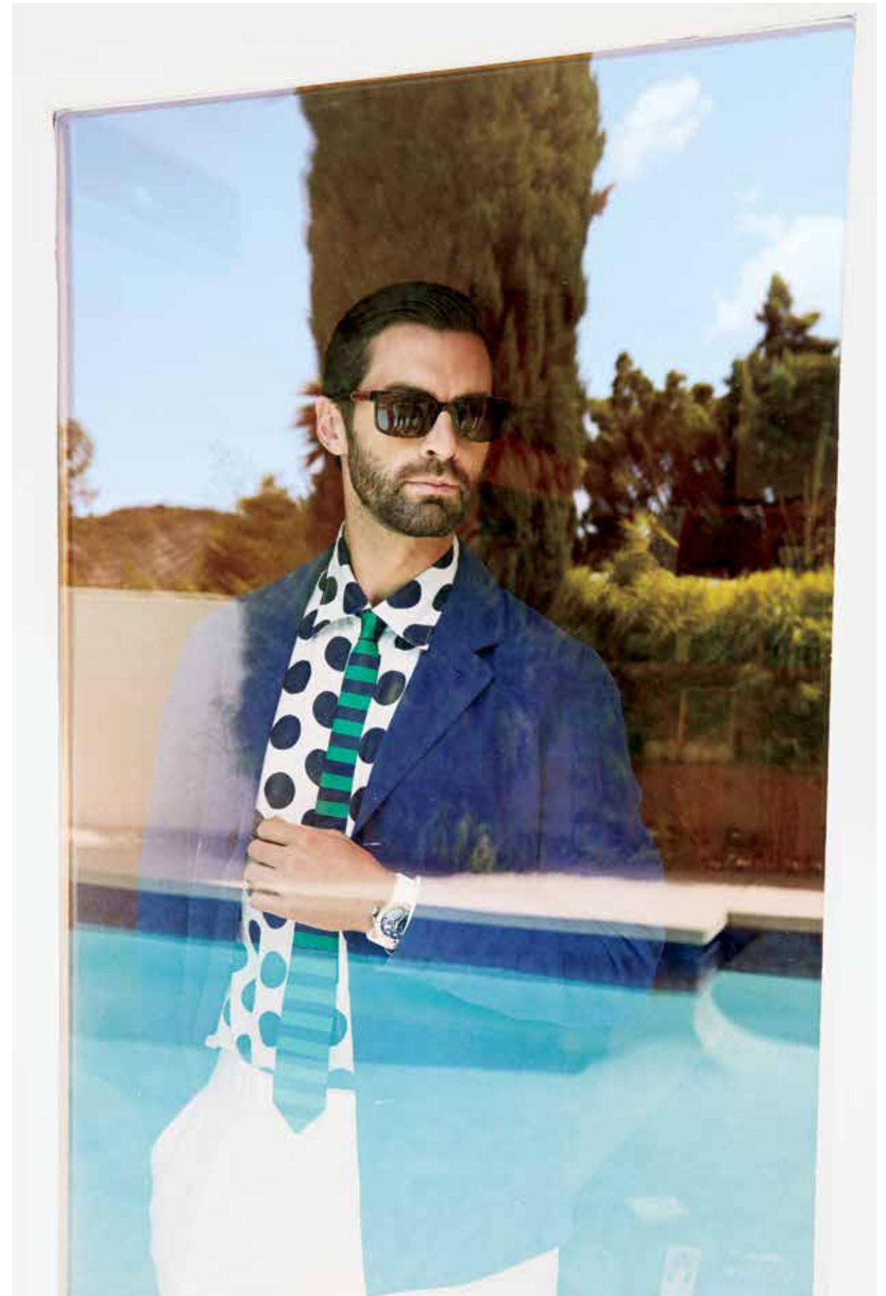
BURBERRY PRORSUM cropped caban jacket ($1,595), canvas shirt ($595), tie ($295) and sunglasses ($220). TOM FORD linen trousers ($1,210). RICHARD MILLE red-gold and titanium watch ($120,000).