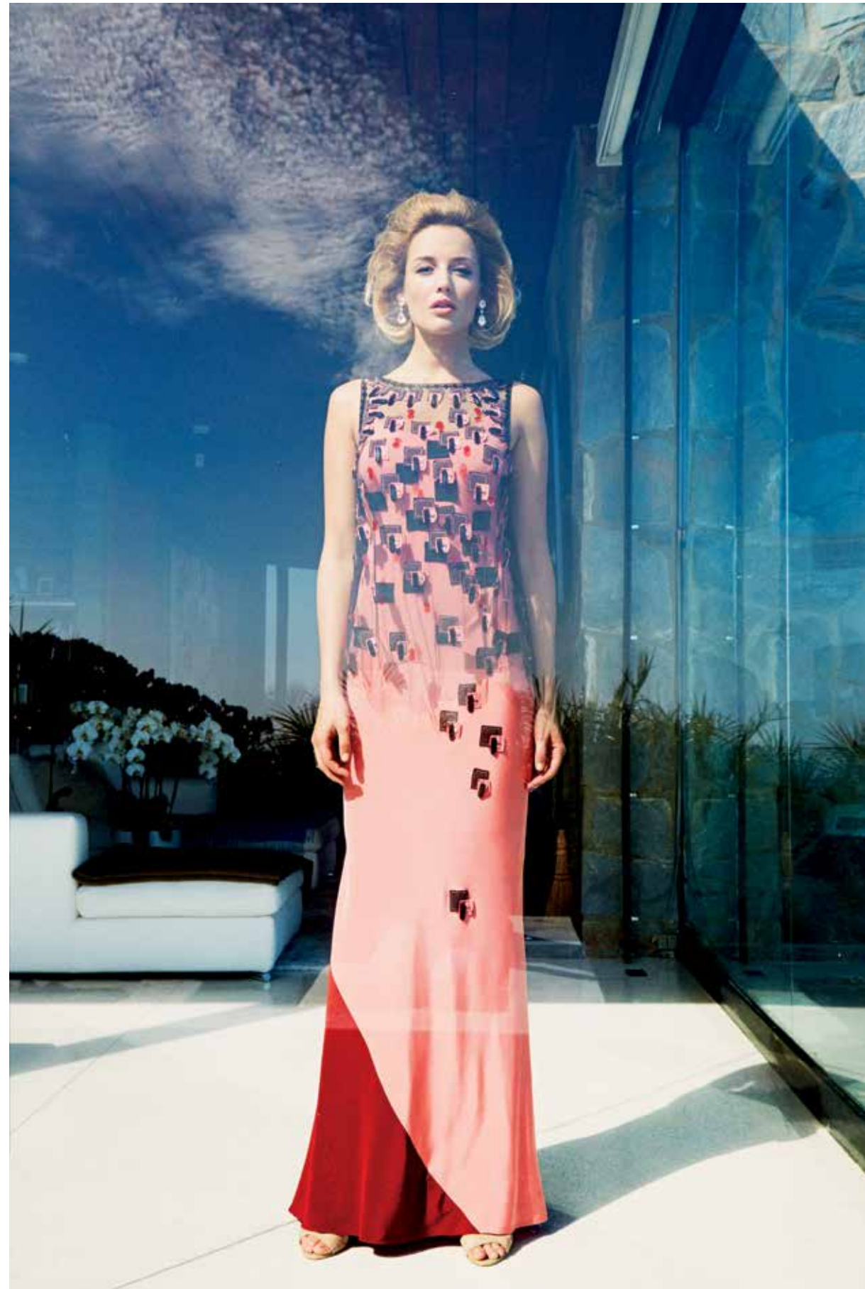
CAROLINA HERRERA mirrored gown with net overlay ($7,990). HERMÈS suede sandals ($830). VERDURA white and blue topaz earclips ($10,950).