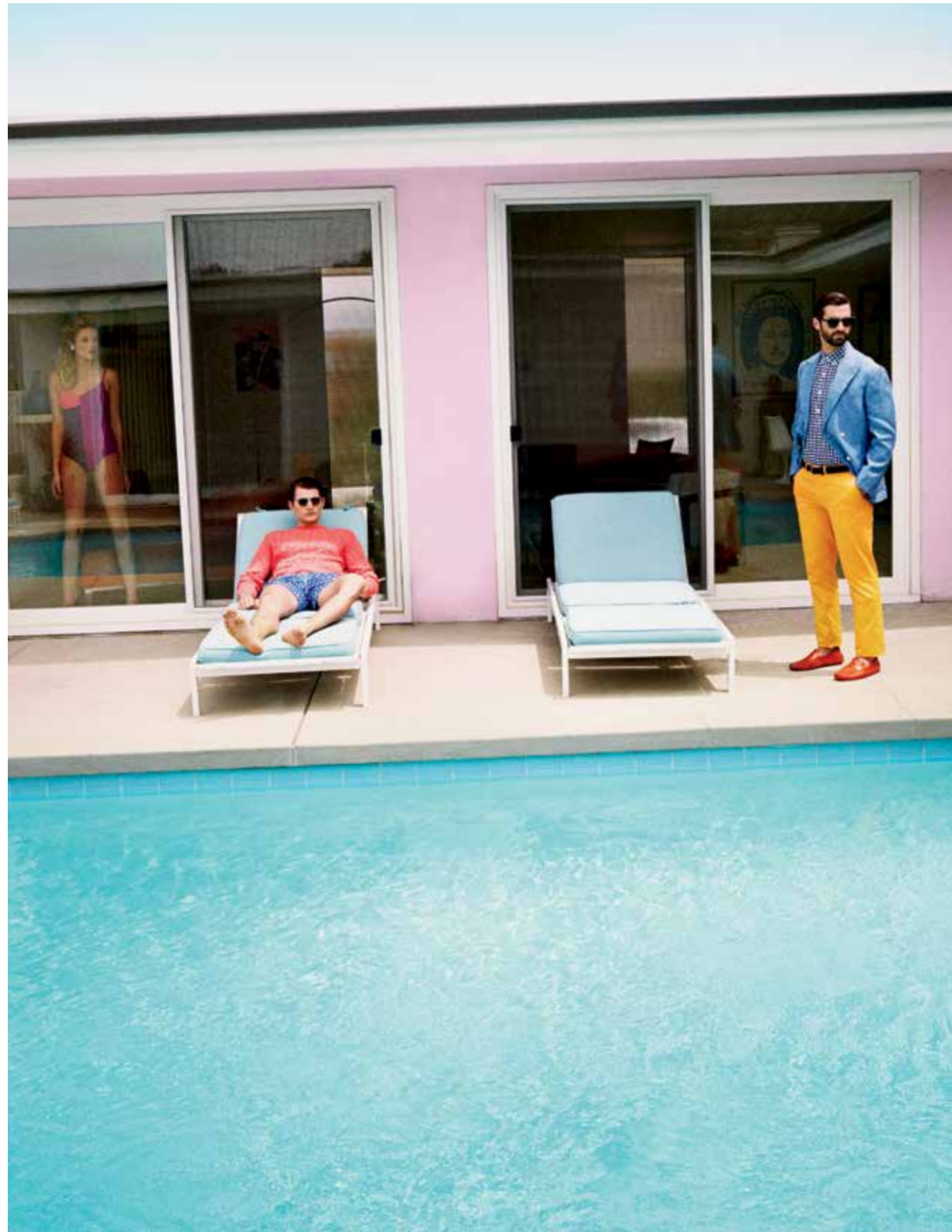
On her: ARAKS maillot ($350). Sitting: PAUL STUART cable-knit sweater ($230) and foulard swim trunks ($150). MOSCOT sunglasses ($390). Standing: ASCOT CHANG linen blazer (from $1,850). HAMILTON SHIRTS linen popover ($225). SEIZE SUR VINGT trousers ($240). TOD'S driving shoes ($845). BRUNELLO CUCINELLI belt ($670). PAUL SMITH sunglasses ($385).