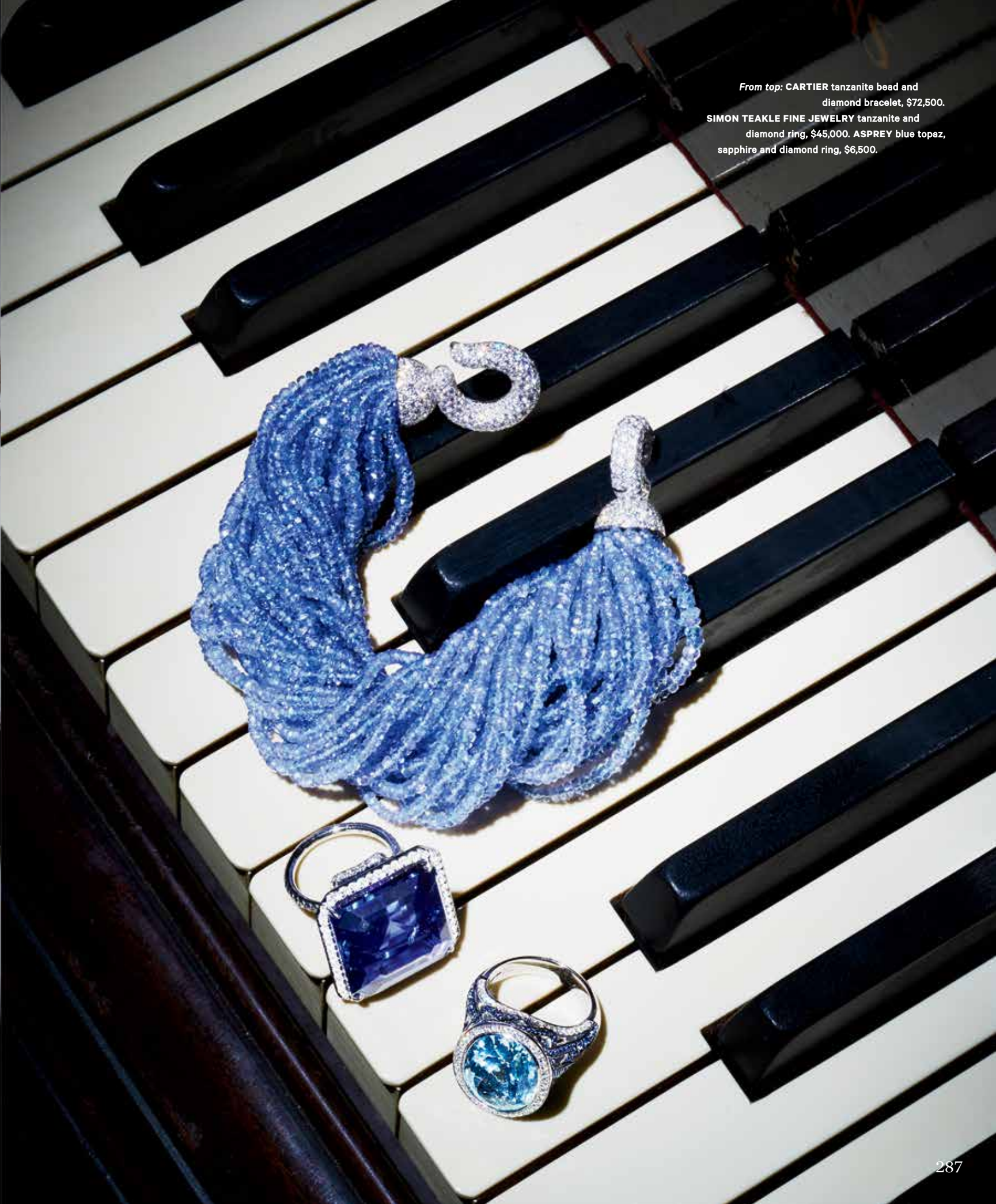
From top: CARTIER tanzanite bead and diamond bracelet, $72,500. SIMON TEAKLE FINE JEWELRY tanzanite and diamond ring, $45,000. ASPREY blue topaz, sapphire and diamond ring, $6,500.