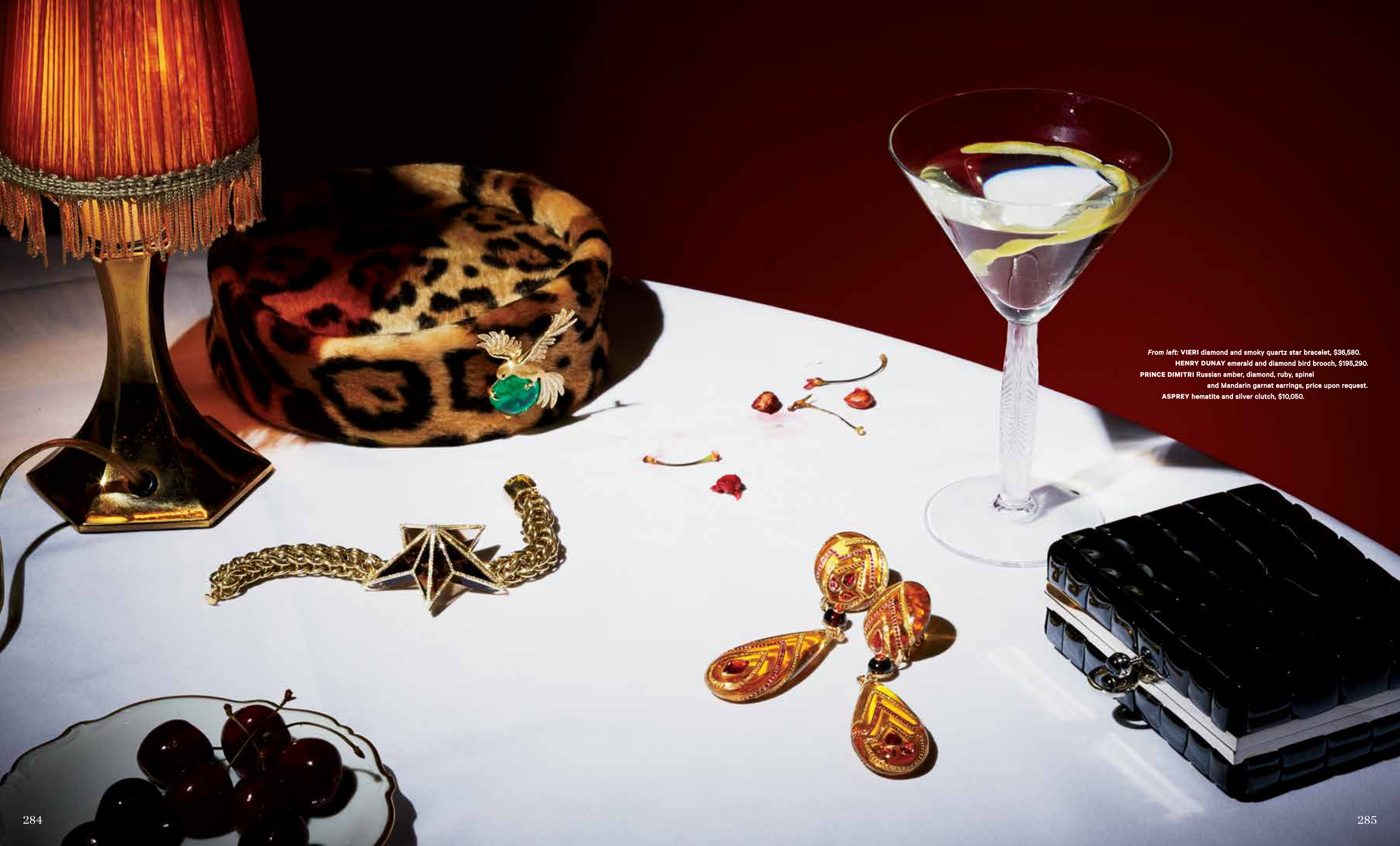
From left: VIERI diamond and smoky quartz star bracelet, $36,580. HENRY DUNAY emerald and diamond bird brooch, $195,290. PRINCE DIMITRI Russian amber, diamond, ruby, spinel and Mandarin garnet earrings, price upon request. ASPREY hematite and silver clutch, $10,050.