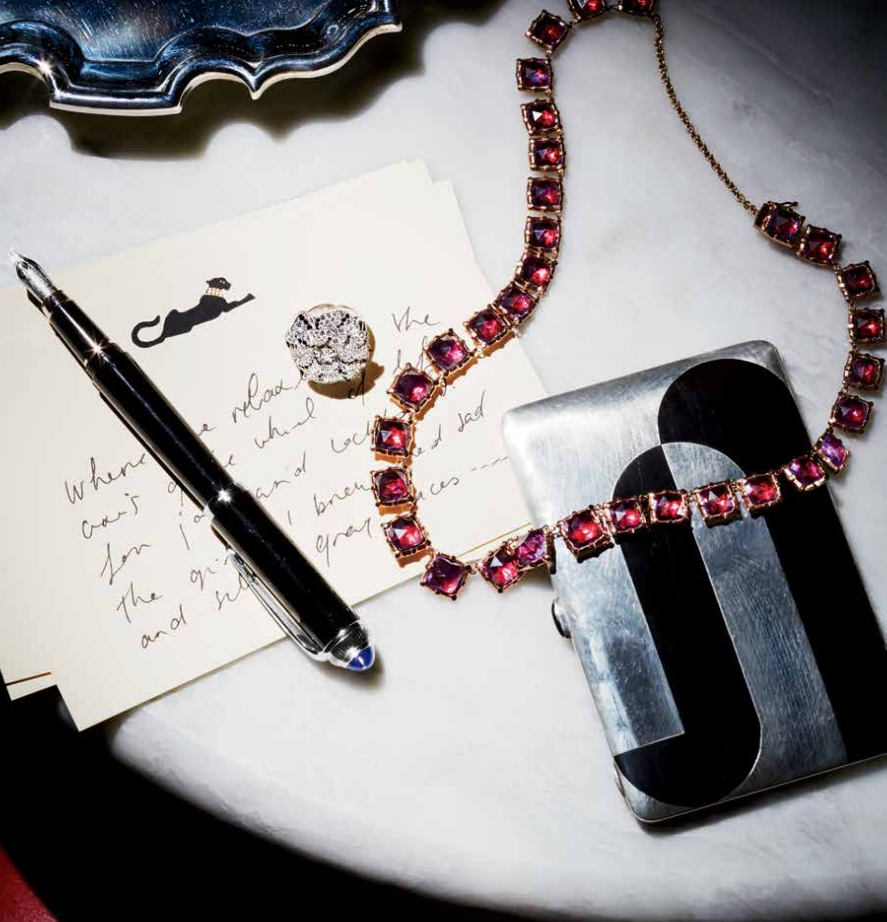
From left: CARTIER enamel pen, $730. CHANEL black and white diamond Camella Nervure ring, $135,000. LARKSPUR & HAWK pink amethyst necklace, $3,200. SIEGELSON silver and lacquer vintage Jean Fouquet cigarette case, price upon request.