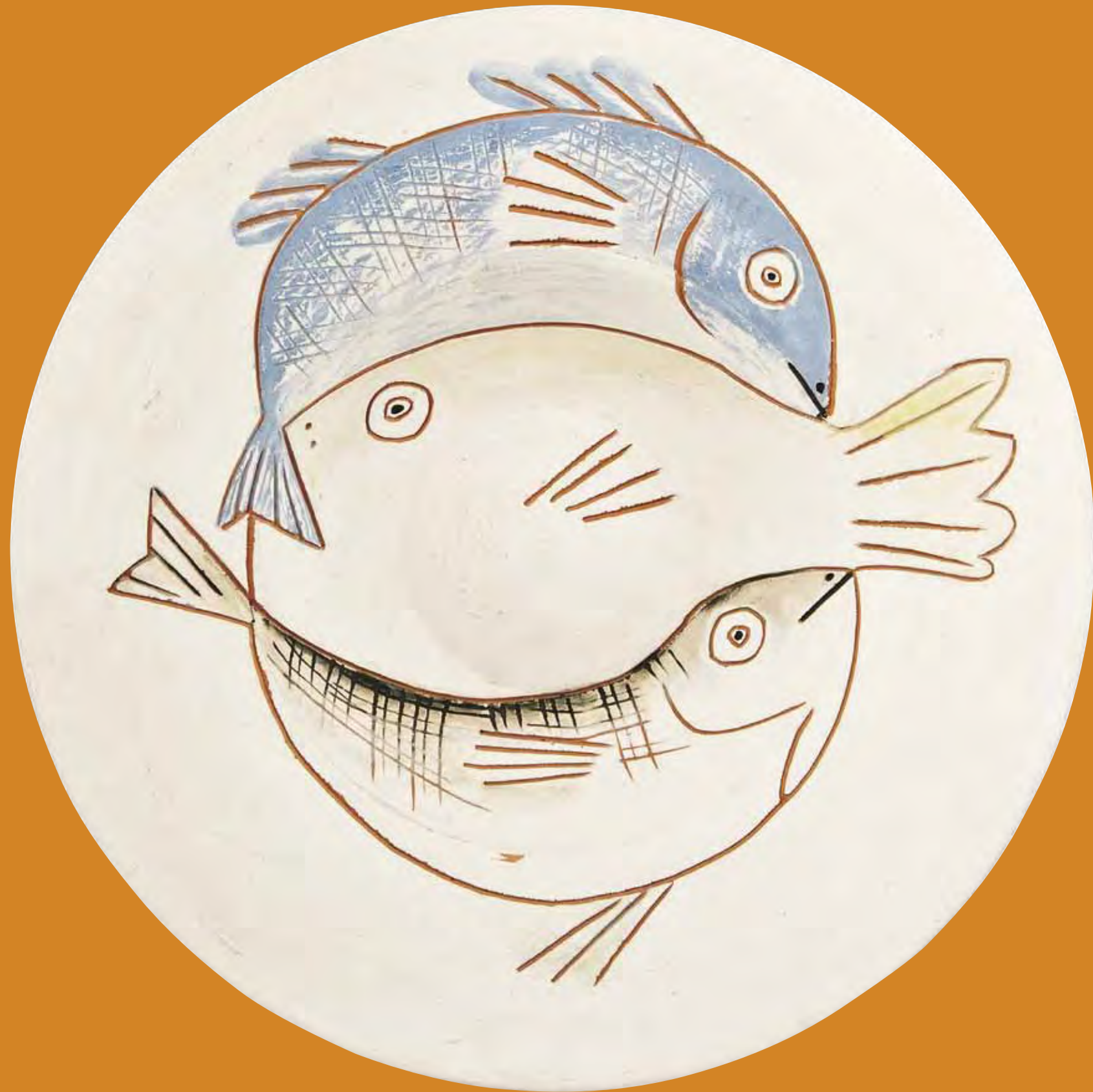
Trois Poissons (Three Fish), 1957

While most of Picasso's ceramic pieces were, like this plate, one-of-a-kind, he did allow for limited editions ranging from 25 to 500, which the Madoura studio in turn sold to people passing through Vallauris.