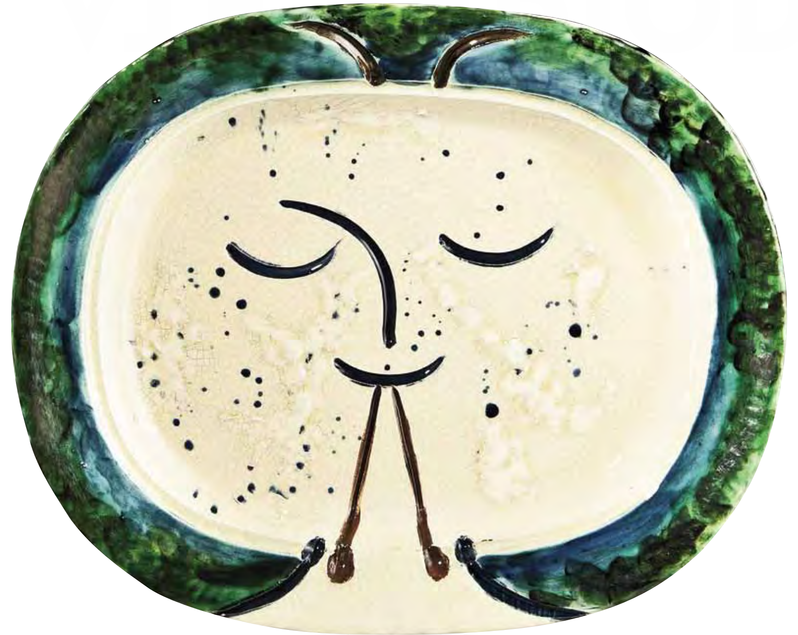
Joueur de Flûte (Flute Player), 1947

Picasso channeled the simple life in his ceramics, which have been described as having an "unclouded lightness." Animals—bulls, horses and especially goats—were among his favorite subjects.