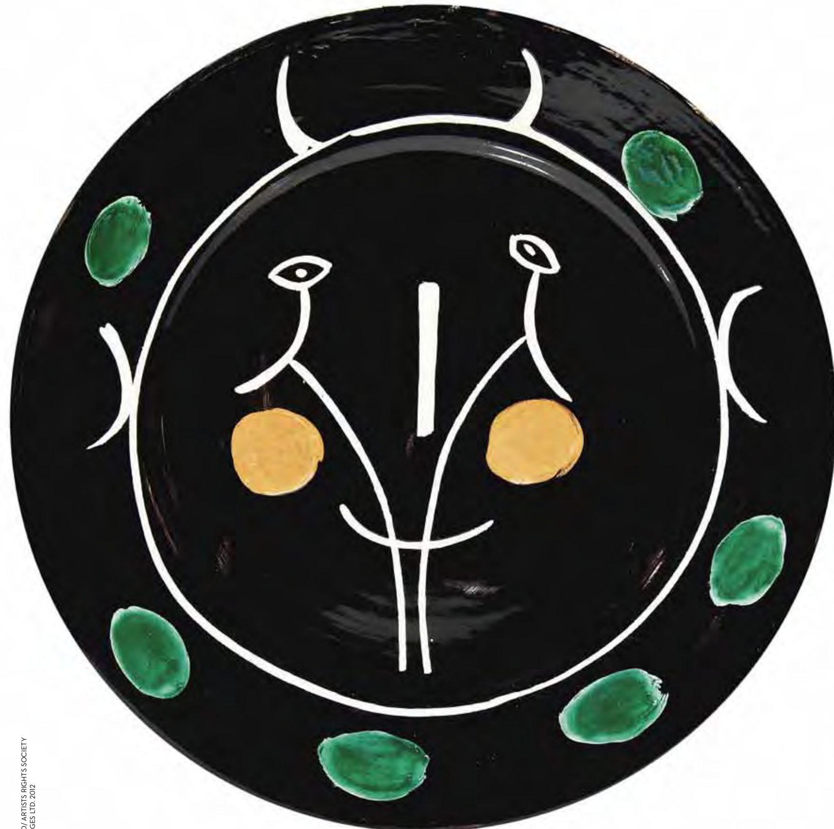
Service Visage Noir (Black Face), 1948

While most of Picasso's ceramic pieces were, like this plate, one-of-a-kind, he did allow for limited editions ranging from 25 to 500, which the Madoura studio in turn sold to people passing through Vallauris.