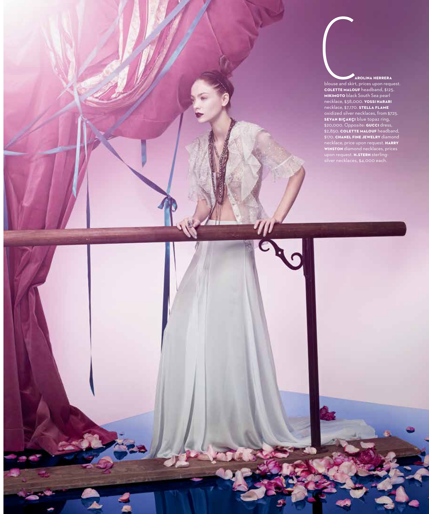
C AROLINA HERRERA blouse and skirt, prices upon request. COLETTE MALOUF headband, $125. MIKIMOTO black South Sea pearl necklace, $38,000. YOSSI HARARI necklace, $7,170. STELLA FLAME oxidized silver necklaces, from $725. SEVAN BIÇAKÇI blue topaz ring, $20,000. Opposite: GUCCI dress, $2,850. COLETTE MALOUF headband, $170. CHANEL FINE JEWELRY diamond necklace, price upon request. HARRY WINSTON diamond necklaces, prices upon request. H.STERN sterling-silver necklaces, $4,000 each.