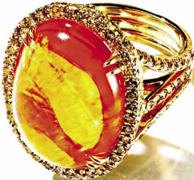
TAMSEN Z fire opal ring, $187,200; tamsenz.com